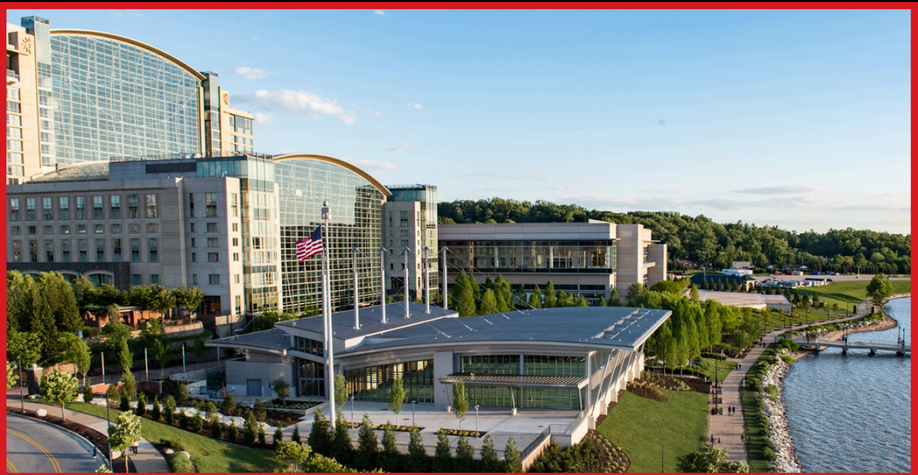
GAYLORD NATIONAL RESORT | NATIONAL HARBOR, MD