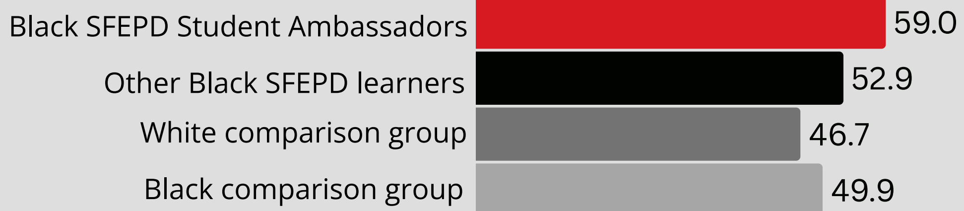
Mean financial well-being scale

Note: The CFPB scale is a research-backed measure of overall financial well-being on a 19-82 scale.